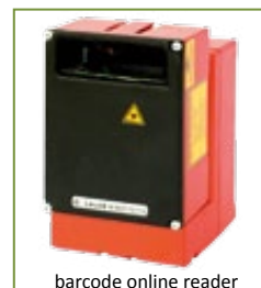
barcode online reader